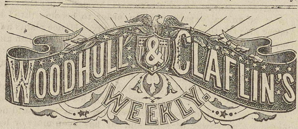
NEW YORK, SATURDAY, MARCH 1, 1873.